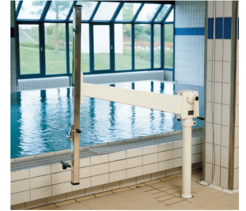
The Pool Lift can be secured to the floor either by means of a socket or by a base plate.