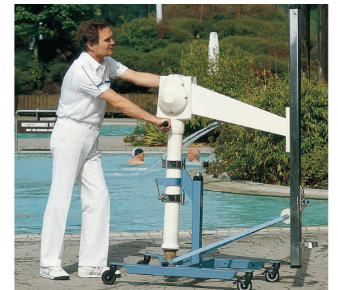
The ArjoHuntleigh Pool Lift transporter makes lifting and moving the Pool Lift to a store, or from one installation point to another in the pool area, virtually effortless.