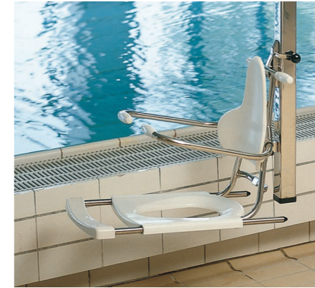
A leg rest for the ArjoHuntleigh Pool Lift chair makes transfers into above ground pools smoother.