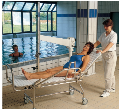
The stretcher is wide and comfortable, and the trolley has swivelling casters which make it easy to operate.