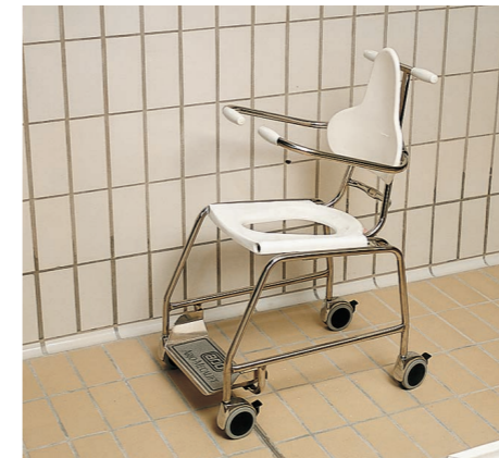
The ArjoHuntleigh Pool Lift chair has armrests which fold back. The removable chassis is equipped with brakes on all four casters to make the transfer to and from it safe and simple. All parts are made of plastic or stainless steel.