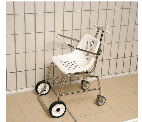
The ArjoHuntleigh Pool Lift swimchair also has folding armrests. The fixed chassis is made of high quality materials and specially designed for use in water. The large front wheels make it easy to move in the pool and the brakes on the rear casters make all transfers safe.