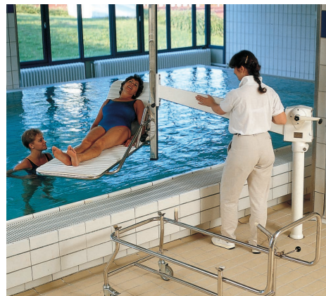
Attach the stretcher to the lift. Detach the trolley. Lower your patient into the water. This is a smooth, safe operation.