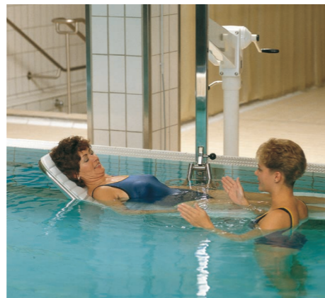
Your patient can stay on the stretcher for their exercises, or, with some assistance, ease themselves into the water.