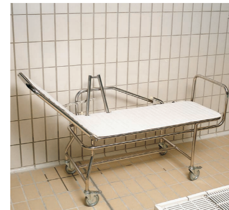
The ArjoHuntleigh Pool Lift stretcher has a comfortable mattress. Velcro makes it easy to remove for cleaning etc. The ArjoHuntleigh Pool Lift stretcher trolley is made of stainless steel.